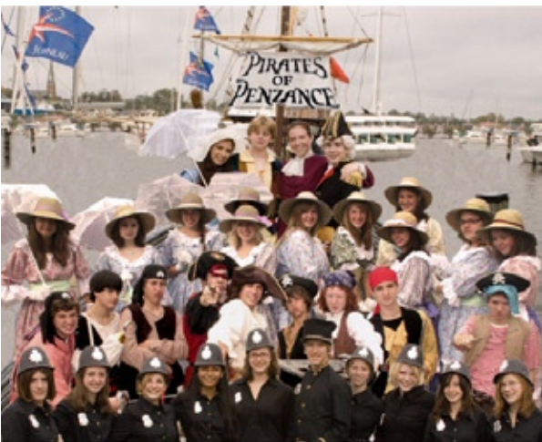
Severna Park High School Stage Company cast of The Pirates of Penzance.

Severna Park High School Stage Company is proud to present its' fall Production of Gilbert & Sullivan's The Pirates of Penzance! The cast of 42 student performers, the endearing music and the comical tale will delight audiences young and old.